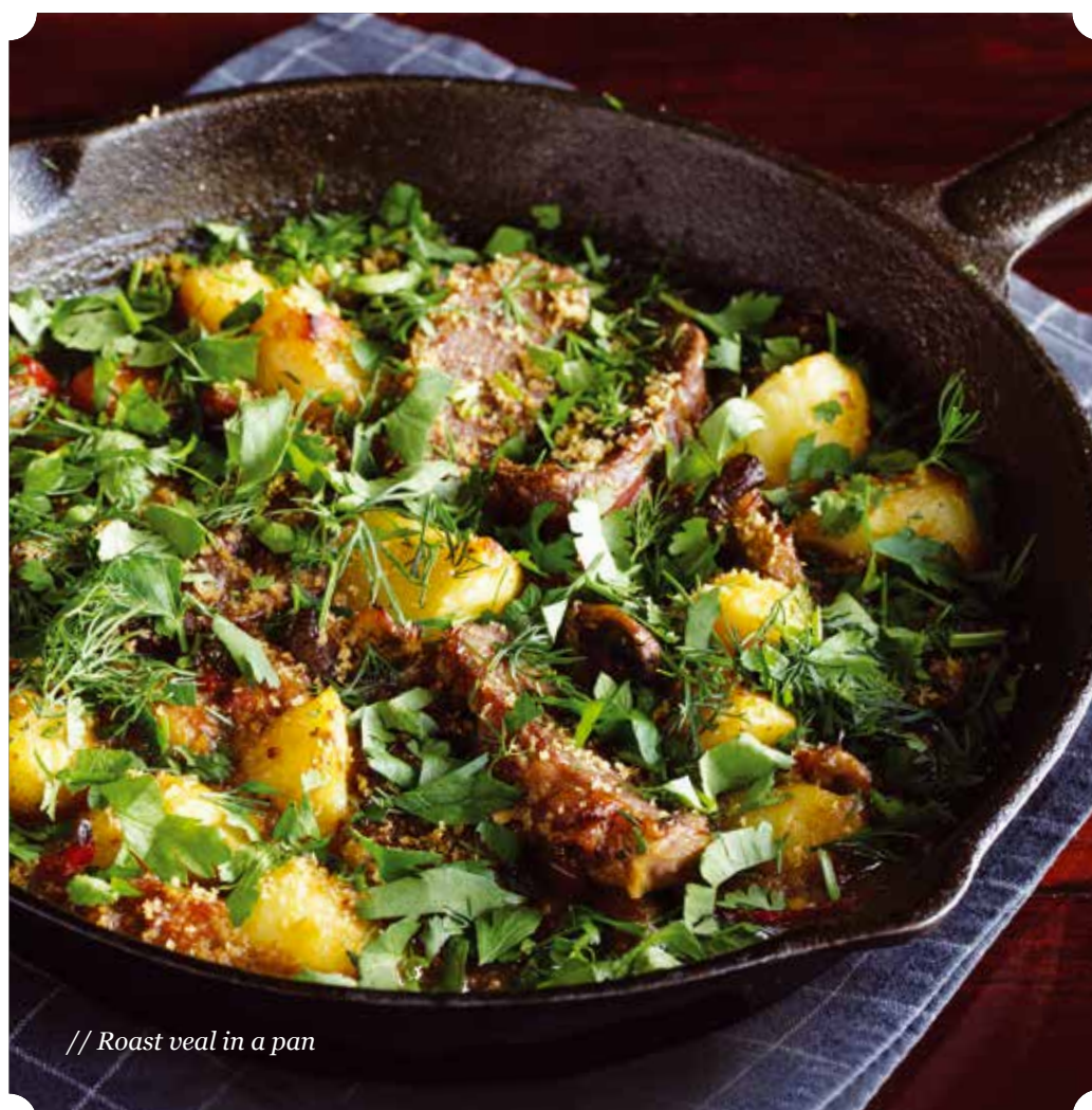
// Roast veal in a pan

Baked Turkey Leg ..... new! 590 ₺ with new potatoes and mushroom sauce