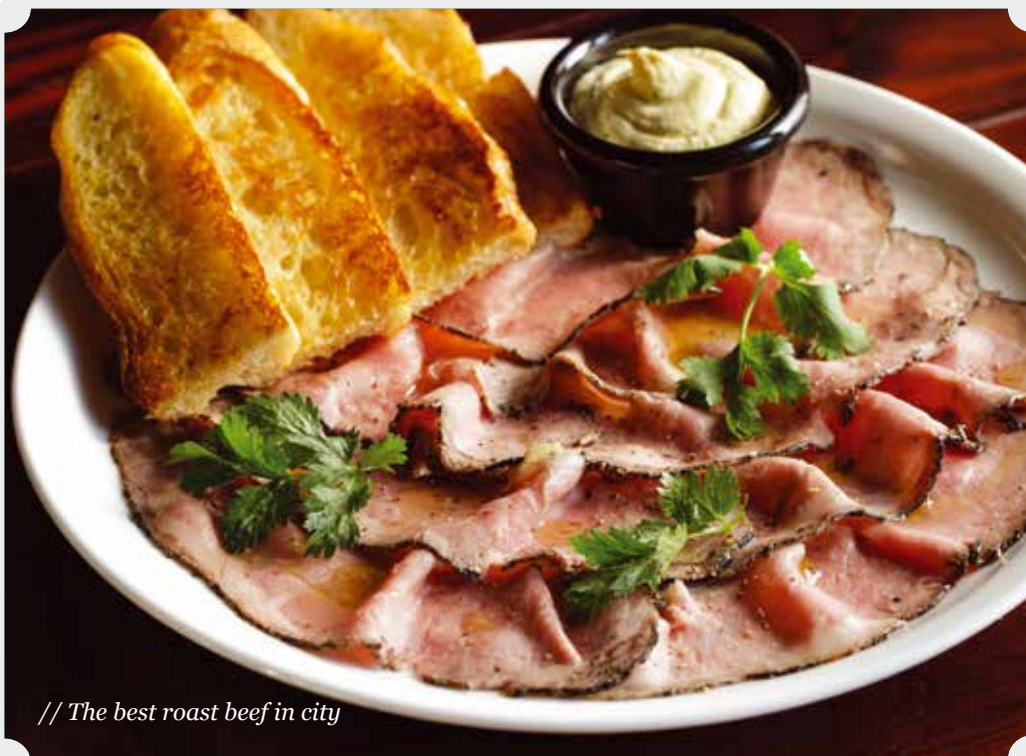
// The best roast beef in city

Salted Caramel Nuts..... 190 ₺ peanuts, almonds, cashews, walnuts