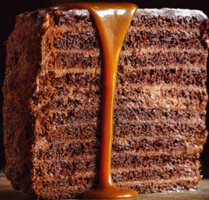
// Chocolate cake