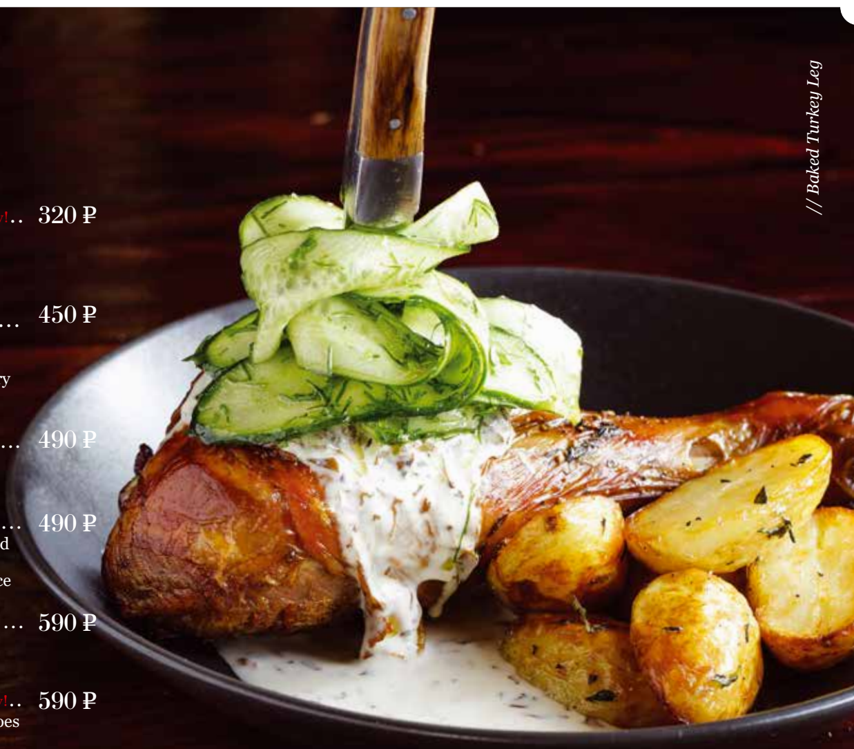
// Baked Turkey Leg

Pike perch fillet .. new! 590 ₺ with spinach, cherry tomatoes and mashed potatoes